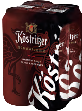
Köstritzer Schwarzbier 4 x 0.5 l can