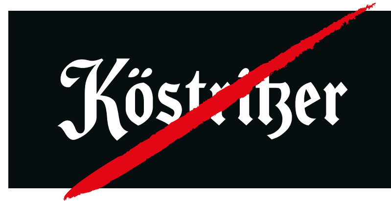
Logo text without red underline

On the right are examples that are inadmissible.