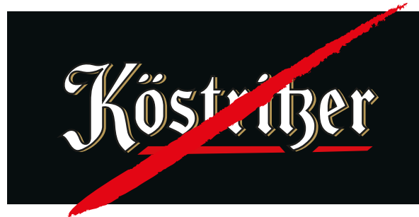
Old logo text with golden shadow