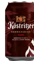
Köstritzer Schwarzbier 6 x 4x 0.33 l can