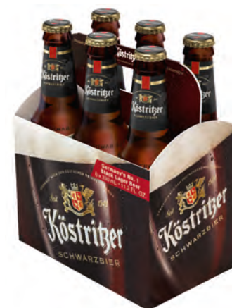
Köstritzer Schwarzbier 6 x 0.33 l bottle