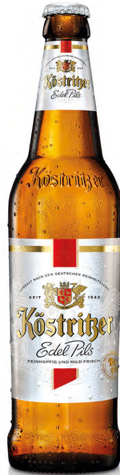
Köstritzer Edel Pils 0.5 litre