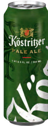
Köstritzer Pale Ale 0.5 l can