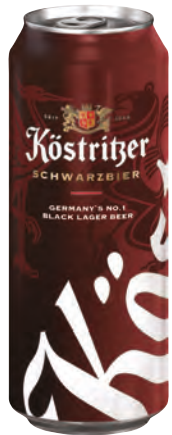
Köstritzer Schwarzbier 0.5 l can