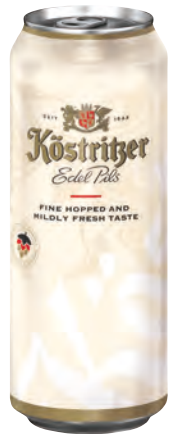
Köstritzer Edel Pils 0.5 l can