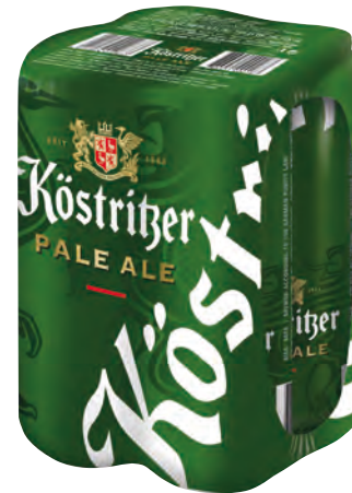
Köstritzer Pale Ale 4 x 0.5 l can