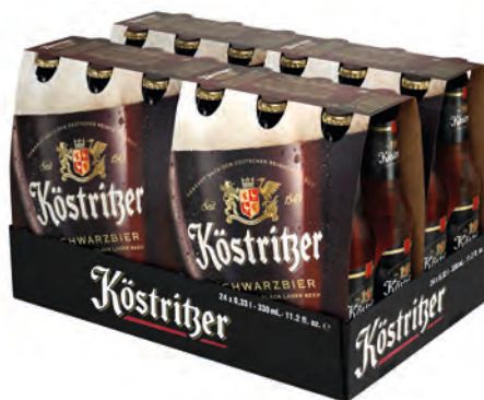
Köstritzer Schwarzbier 4 x 6 x 0.33 l bottle