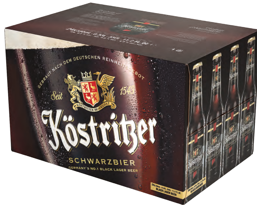
Köstritzer Schwarzbier 24 x 0.33 l bottle, carton