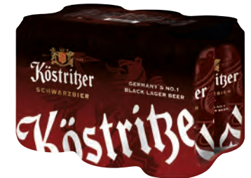
Köstritzer Schwarzbier 6 x 0.33 l can