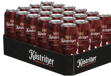
Köstritzer Schwarzbier 24 x 0.5 l can tray