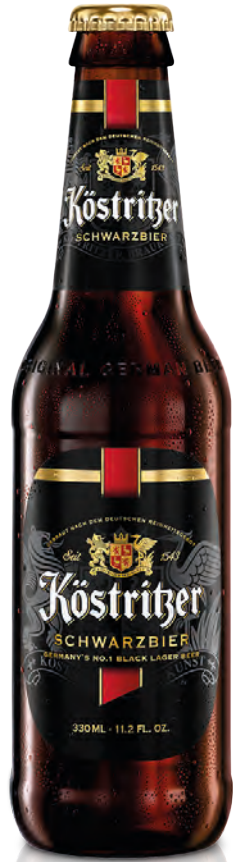
Köstritzer Schwarzbier 0.33 litre