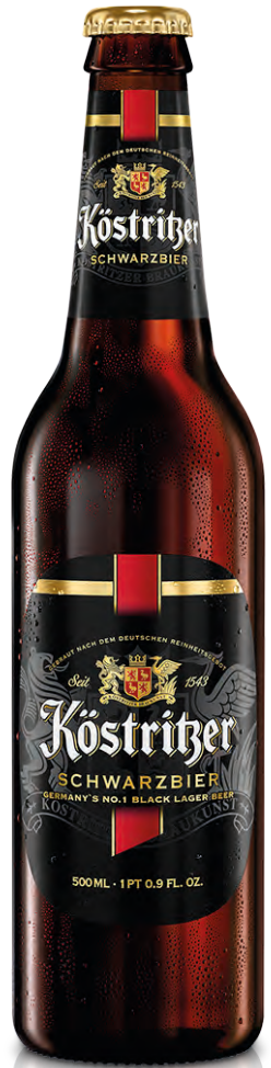
Köstritzer Schwarzbier 0.5 litre