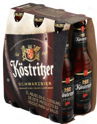
Köstritzer Schwarzbier 6 x 0.33 l bottle