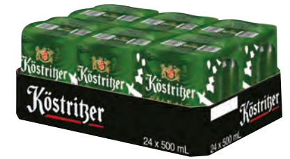
Köstritzer Pale Ale 6 x 4 x 0.5 l can