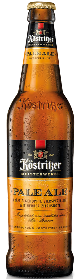
Köstritzer Meisterwerke Pale Ale 0.5 litre