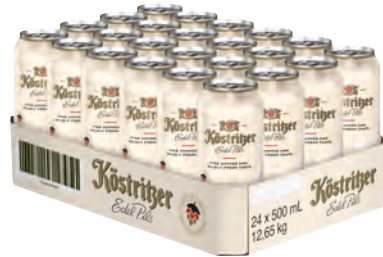
Köstritzer Pale Ale 24 x 0.5 l can tray