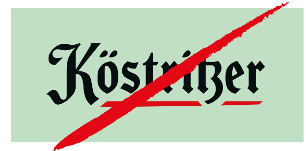
Positive logo text on a light background